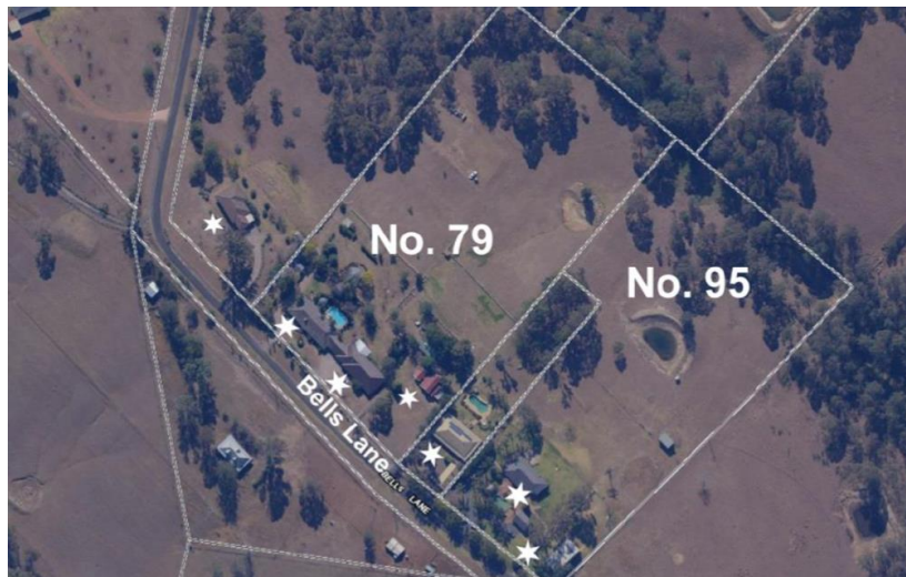
Figure 6 – aerial photo indicating properties along the ridge line fronting Bells Lane.

Notwithstanding the submission that the minimum lot size of 4,000m 2 is appropriate for this property, the proponent would be prepared to amend the planning proposal to permit a minimum lot size of 9,000m 2 on this site only. This would permit subdivision into three rather than five lots and would not result in additional buildings along the ridgeline. Figure 6 is a satellite image showing the location of existing substantial buildings along the ridgeline.