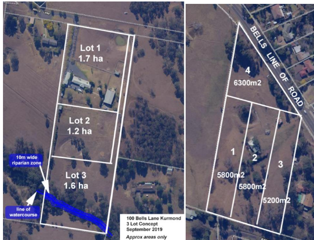
Figure 4 – (L) aerial photo of 100 Bells Lane with proposed lot overlay