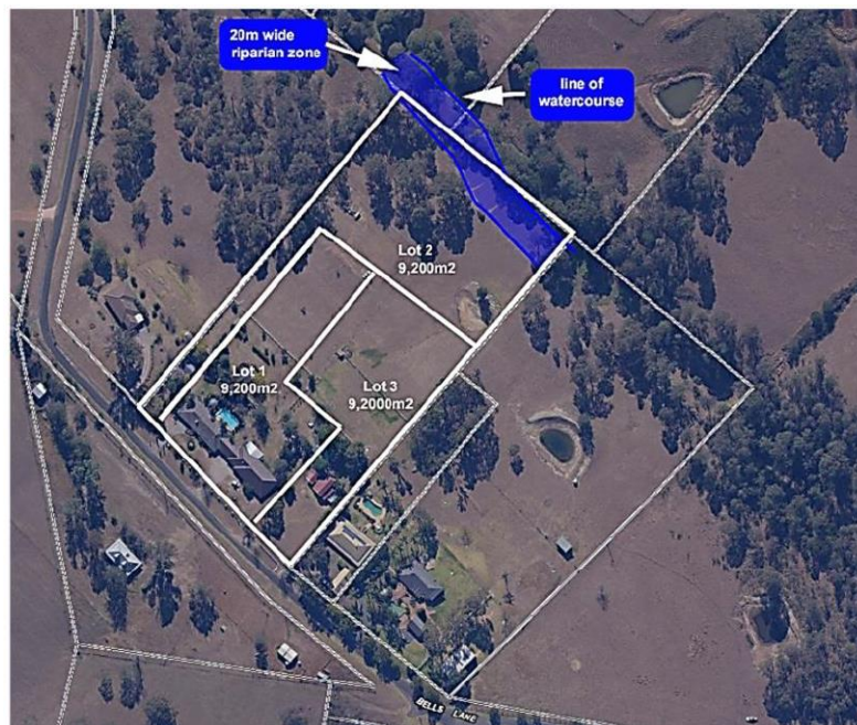
Figure 7 – 3 lot subdivision layout based on 9,200m 2 minimum lot size

A 9,200m 2 minimum lot size (enabling 3 lots) could be configured as shown below, creating no additional buildings along the Bells Lane ridgeline ( Figure 7 ).