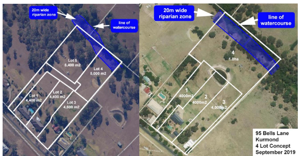
Figure 2 – (L) aerial photo of 79 Bells Lane with proposed lot overlay

The current planning proposal (dated September 2019) ( Attachment C4 ) seeks to reduce the minimum lot size from 10ha to a range of 4,000m 2 to one (1) hectare. This is to enable rural residential subdivision of the sites into 16 lots (Figures 2-5), details are provided in Table 1.